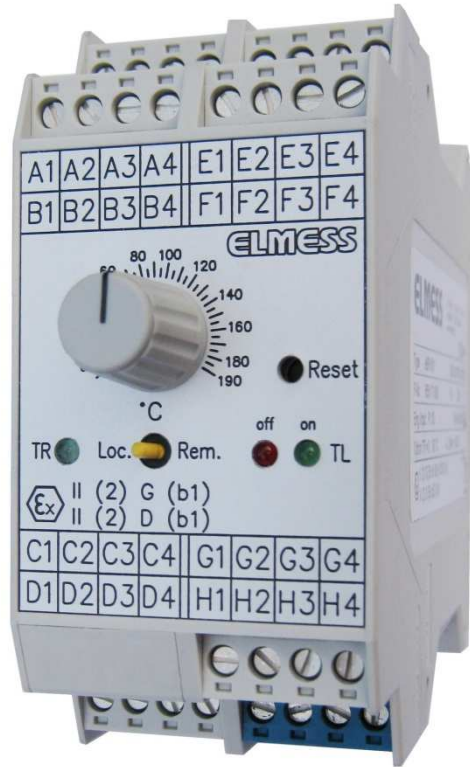
Thermal cut-out eBR6000